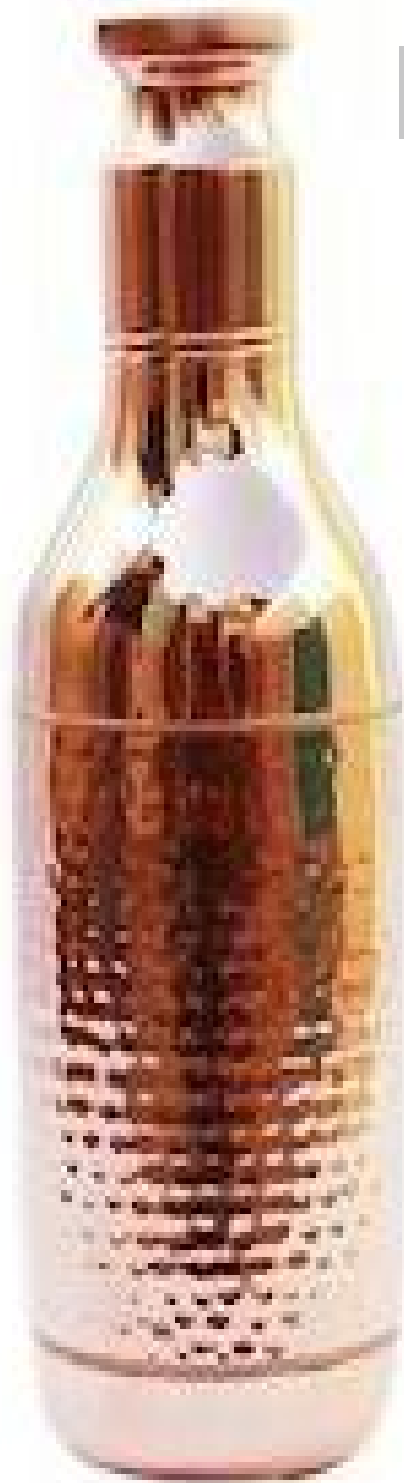
AN= Copper Champagne Bottle