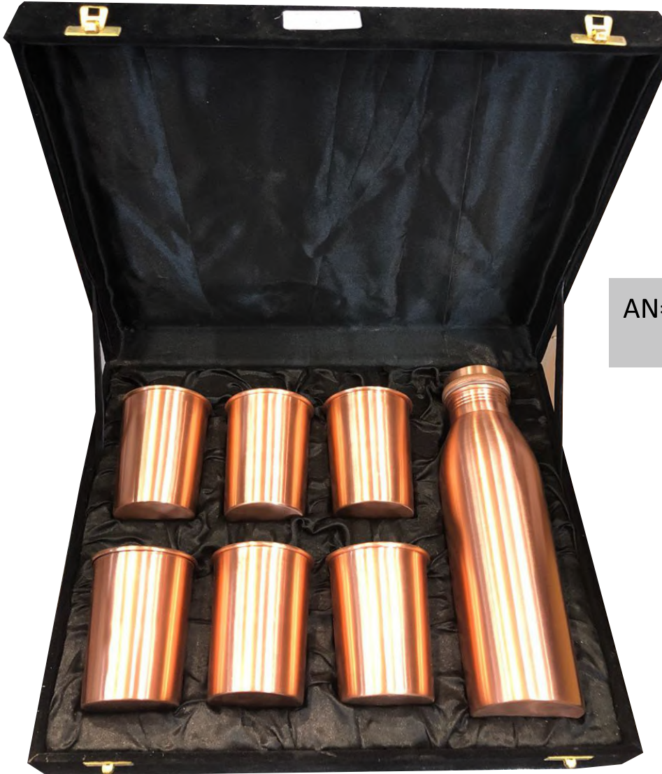
AN= Copper Bottle with 6 glasses (Velvet box packing)