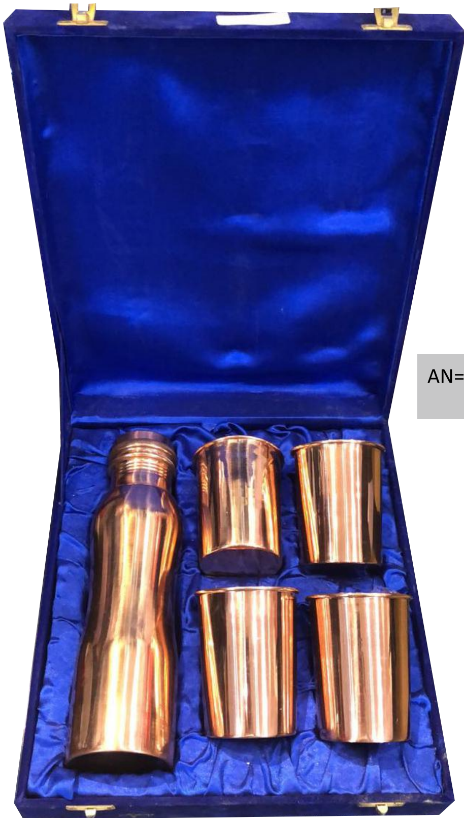
AN= Copper Bottle with 4 glasses (Velvet box packing)