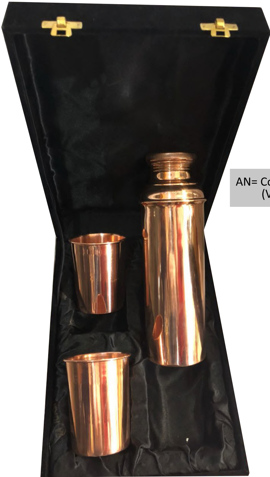
AN= Copper Bottle with 2 glasses (Velvet box packing)